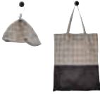
Tati cap, bag